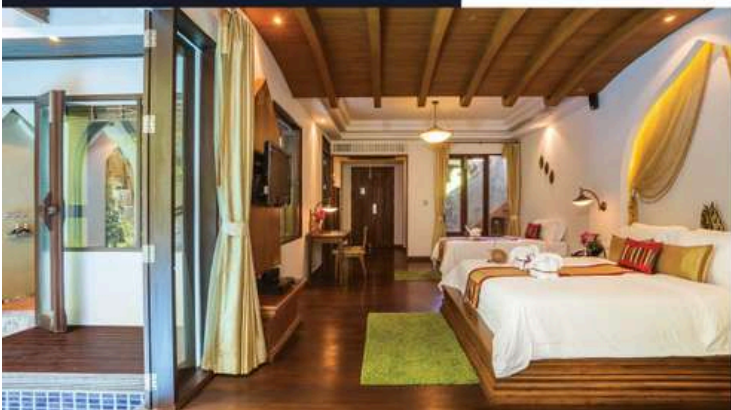
Garden View FAMILY POOL SUITE 16 Suites | Ground floor 125 sq.m.

1 King-size bed & 1 single bed | Jacuzzi whirlpool | Private terrace and pool | capacity 3 persons The suite offers a private pool and tranquil garden views. Spacious and soothing, it's ideal for shared relaxation and comfort.