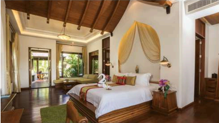
Garden View GRAND DELUXE SUITE 32 Suites | Second floor 90 sq.m.

Tranquil Suites with Private Terraces featuring warm wooden furnishings and ceiling designs inspired by traditional fishing boats and the surrounding natural beauty.