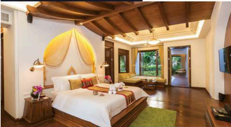
Garden view POOL SUITE 16 Suites | Ground floor 125 sq.m

1 King-size bed | Sofa | Jacuzzi whirlpool | Private terrace and pool | capacity 2 persons The elegant suite features a private plunge pool amid lush greenery. Its refined interiors and Jacuzzi bathroom promise calm and wellness.